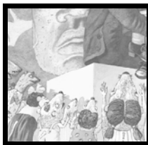
The Greater New York younger sibling