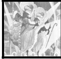
Aspidistra and Myrtle